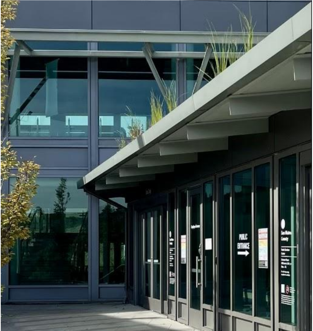
Entrance to the Youth Services Center