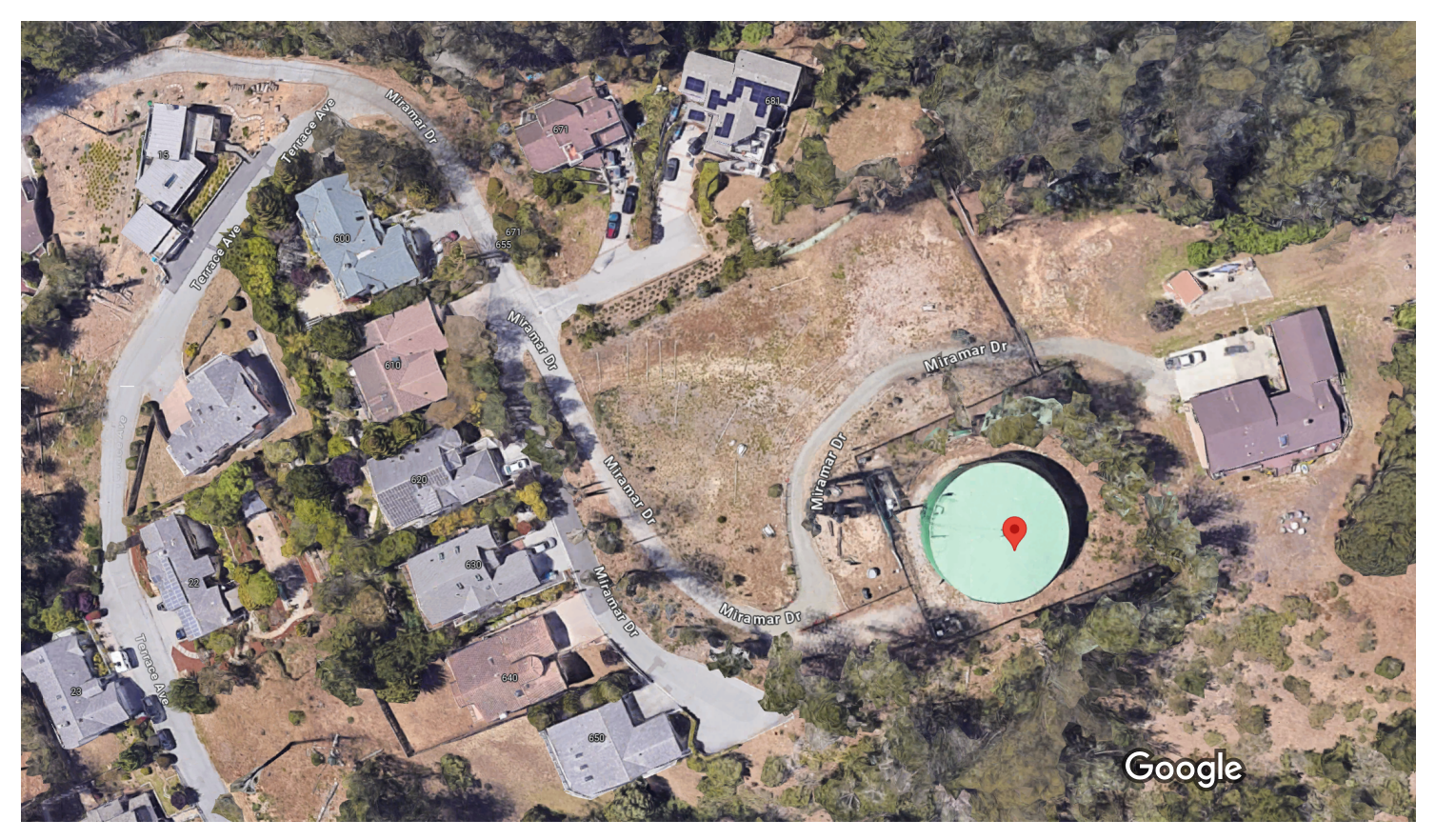
Imagery ©2023 Google, Imagery ©2023 Airbus, CNES / Airbus, Maxar Technologies, U.S. Geological Survey, Map data ©2023 50 ft